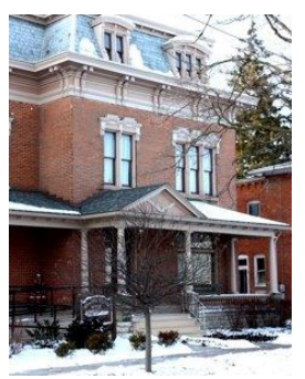
The Grammes-Brown House, 172 Jefferson Street

Tiffin Homes on Tour, December 2, 2018, 1:00-5:00 p.m.