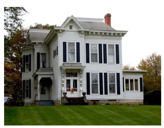
The Hunt Home, 594 South Washington Street