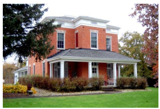
Lang-Neal Home, 778 East County Road 50 (Greenfield Street)