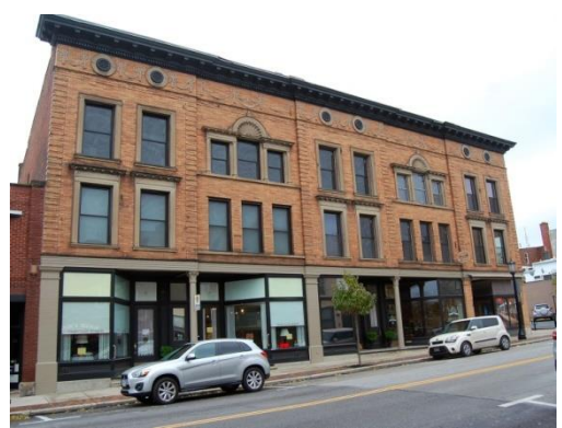
The Loft, 25 South Washington St.