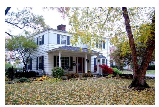
The Stark Home, 21 Herrick Court