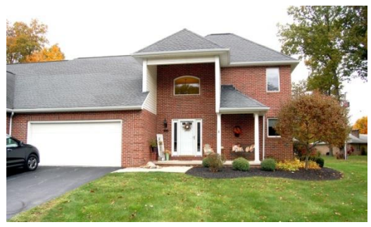
The Schweitzer Home, 544 Hedgegate North